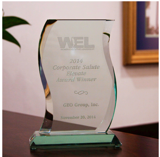
In 2014, GEO was recognized by Women Executive Leadership as a Corporate Salute Award winner for outstanding commitment to gender diversity, by having two or more women on the Board of Directors.