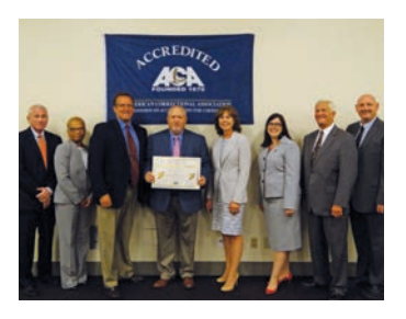
100% Coastal Bend Detention Center