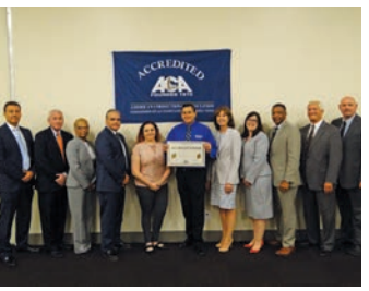
100% Las Vegas Community Correctional Center