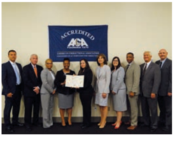
100% Walker Hall