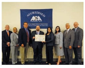
98.6% East Hidalgo Detention Center