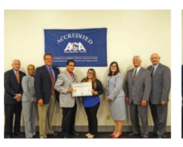
99.4% South Texas ICE Processing Center