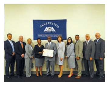
100% Oxford Facility