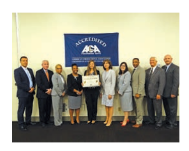
100% Penn Pavilion