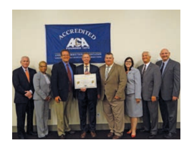
99.5% Arizona State Prison-Kingman